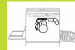
The old master is removed, and a new master is automatically exposed and loaded