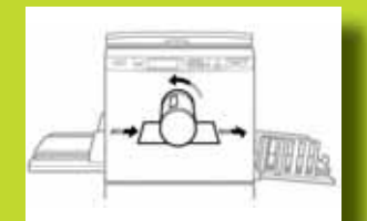
Straight paper path accommodates a wide variety of paper stocks